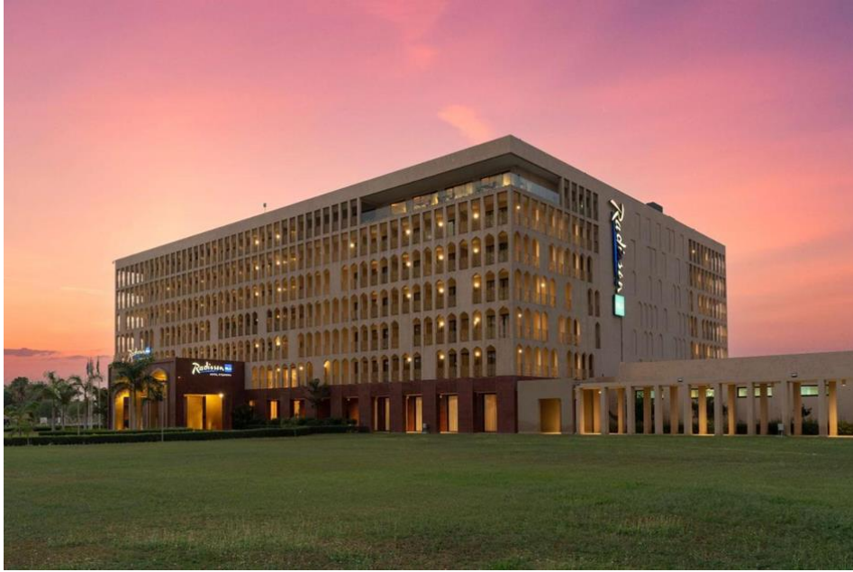
Radisson Blu, N'Djaména